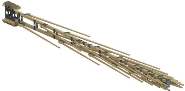
Figure 2: Antenna in stowed configuration